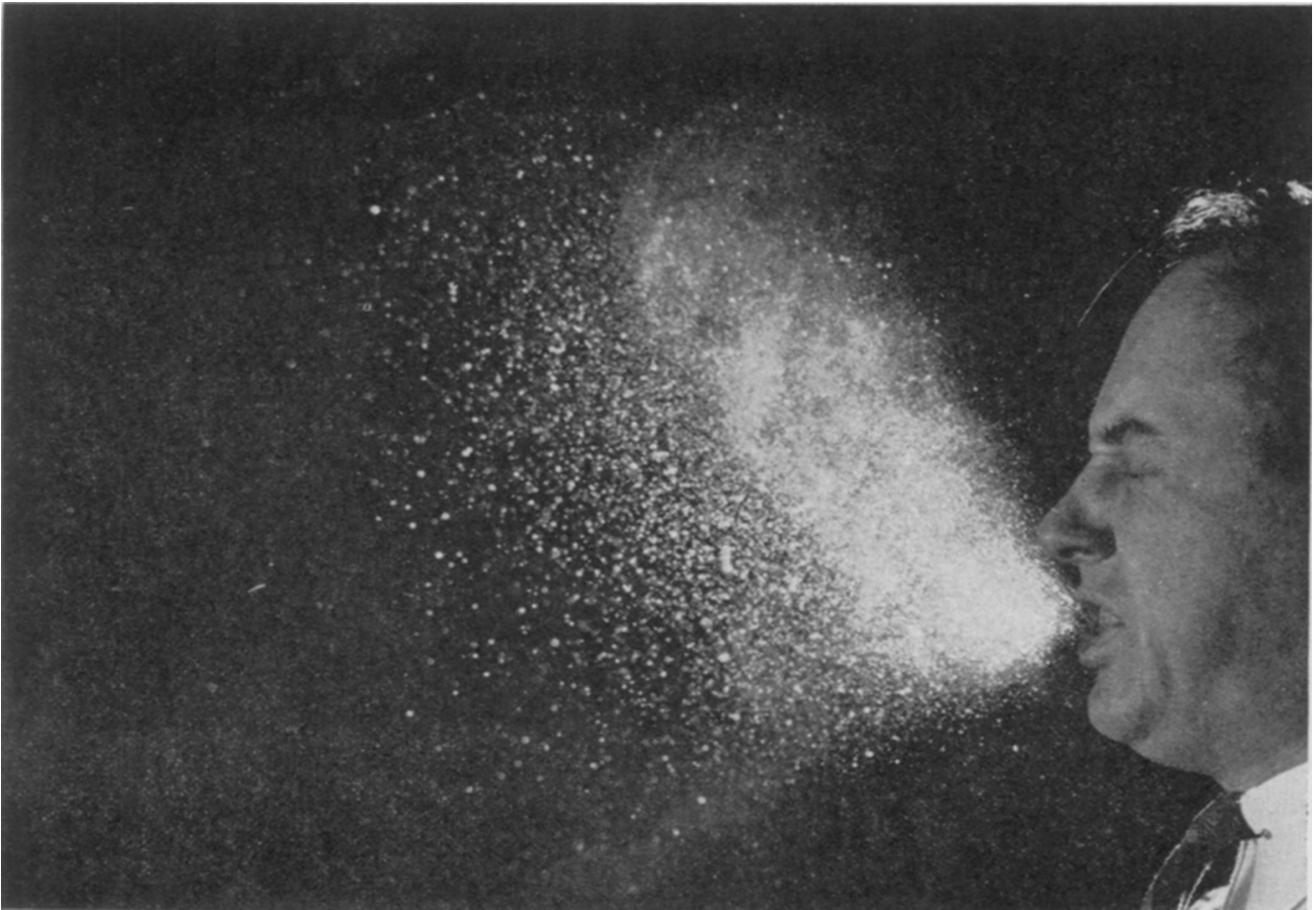
Fig 1 | Short range still imaging of stages of sneezing, revealing the liquid droplets from the 1942 Jennison experiment. 5 Reproduced with permission

Yet eight of the 10 studies in a recent systematic review showed horizontal projection of respiratory droplets beyond 2 m for particles up to 60 \mu\text{m} . 7 In one study, droplet spread was detected over 6-8 m (fig 2). 28 These results suggest that SARS-CoV-2 could spread beyond